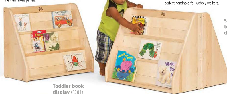
Toddler book display (F381)

Heavily-rounded edges make a perfect handhold for wobbly walkers.