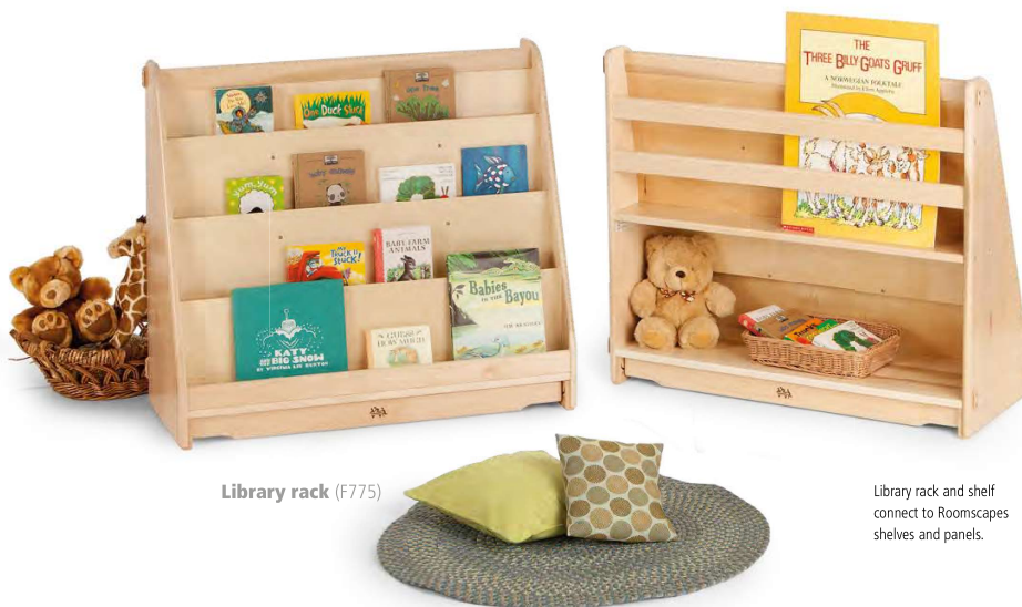
Library rack (F775)

Up to roll. Down to stay. Just flip up the wheels, roll it where you want, then flip them down for a perfectly stationary unit.