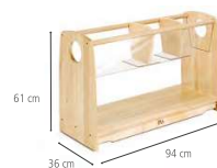
Book trolley F777 Includes 2 Book ends

The Book trolley's clear bin and lower shelf provide visible, accessible book display. Its mobility gives freedom to share a library between classrooms. Easily adapted to other uses, the Book trolley also makes an enticing music and movement trolley or mobile audiobook station.