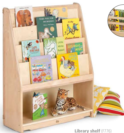
Library shelf (F776)