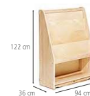
Library shelf F776

You can create a cosy library corner, removed from the general hubbub, by connecting a few Roomscapes panels to the Library rack and shelf.