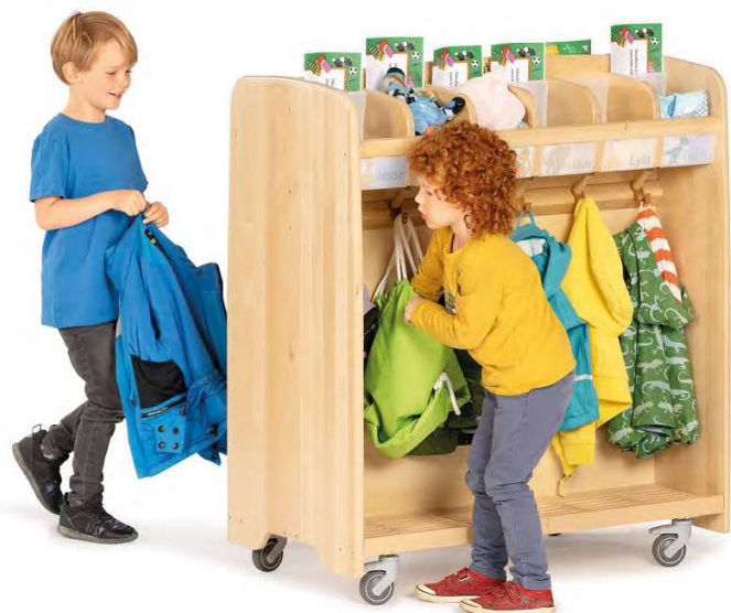
Coat storage trolley (A300)

Water or dirt falls through plastic grates in cubbies. Slide a broom or mop underneath to clear it away.