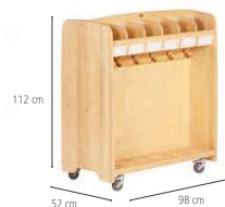
Coat storage trolley A300 For 12 children One coat peg per child