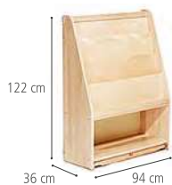
Library shelf F776

Books expand imagination as well as knowledge. They should be clearly displayed for children to easily recognise and select their favourites.