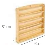
Library panel F747

The space-saving Library panel does double-duty as divider and book display. Mounted directly on the wall in the classroom, office or reception, it can be accessed easily by children, staff or visitors. Connect it with other Roomscapes items to create a customised reading space suited to your needs.