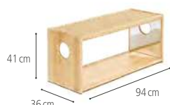
Baby shelf F611

Designed especially for babies learning to walk, the Baby shelf's solid wood construction provides stability for cruising children and sturdy seating for their carers. Mirrors and peepholes in the end panels invite play and discovery. Placed on its side, the Baby shelf becomes a boat any child is delighted to play in.