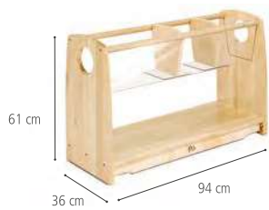
Book trolley F777 Includes 2 Book ends

The Book trolley's clear bin and lower shelf provide visible, accessible book display. Its mobility gives freedom to share a library between classrooms. Easily adapted to other uses, the Book trolley also makes an enticing music and movement trolley or mobile audiobook station.