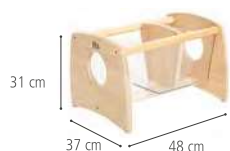
Small browser box F770 Includes 1 Book end