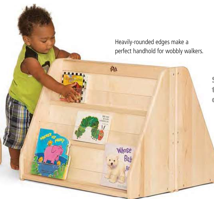
Set of two toddler book displays (F380)