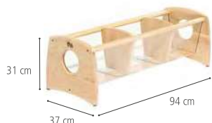
Browser box F778 Includes 2 Book ends

The intriguing shape of the Browser box invites little children to explore. This low, versatile storage bin with high visibility helps toddlers learn to put away their books and toys. Adjust the size of the bins by pushing the dividers along.