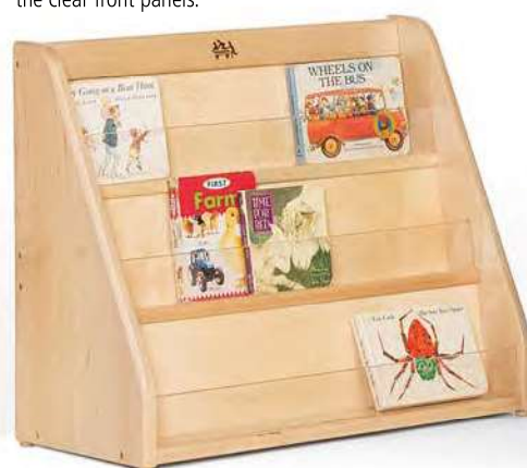
Toddler book display (F381)

Heavily-rounded edges make a perfect handhold for wobbly walkers.