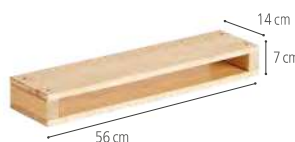
Mini quad B434