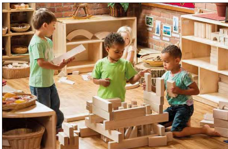
Teamwork: Block play encourages the development of important language and social skills.