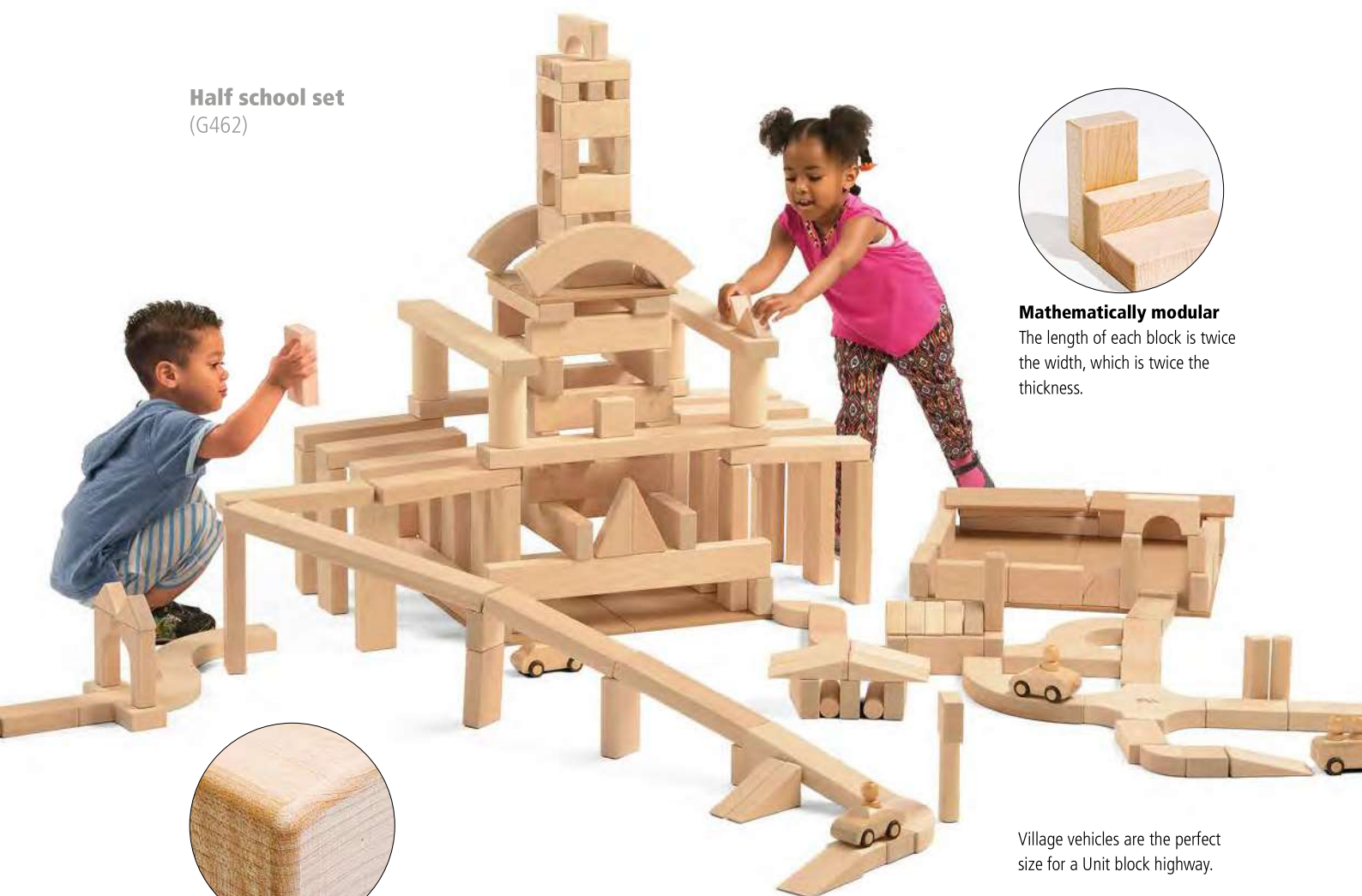
Half school set (G462)

The length of each block is twice the width, which is twice the thickness.