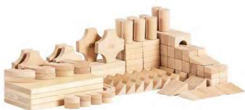
Double set G482 182 blocks in 17 shapes.