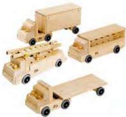
Set of four big trucks

Village vehicles, small trucks and aircraft for ages 1–6