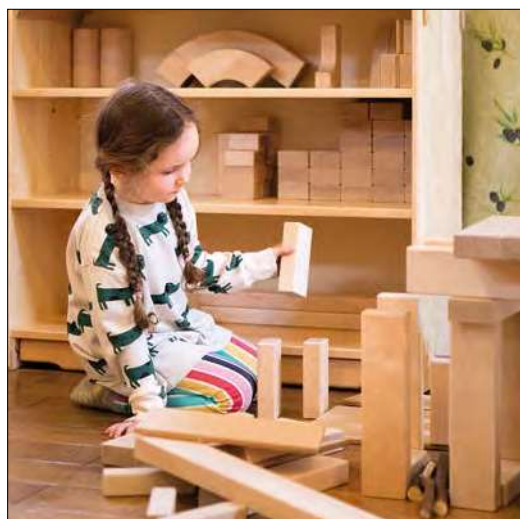
Hands-on learning: Block play solidly supports emerging STEM skills.

Village vehicles are the perfect size for a Unit block highway.