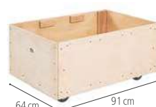
Hollow block trolley A45