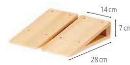
Two mini ramps B423

This open trolley holds the Half nursery set of Mini hollow blocks. The tilted bed keeps everything in.