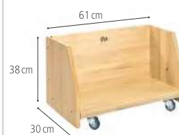
Block trolley A60