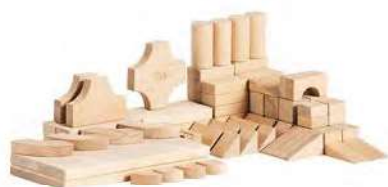
Single set G481 91 blocks in 17 shapes.