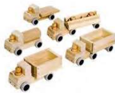
Set of five small trucks