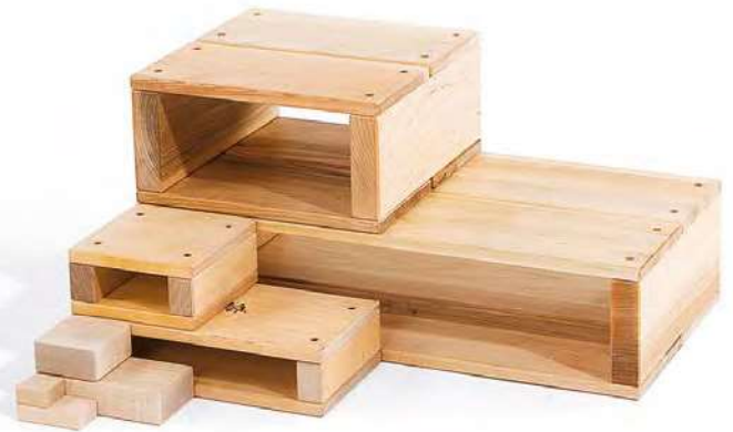
Mini unit blocks p. 143

For over 100 years educators have been promoting the use of blocks in early childhood classrooms as a powerful learning tool. Because modular blocks are so versatile, they offer endless opportunities for a child's imagination to soar while discovering basic math and science principles, practicing problem-solving techniques and social skills, and building a solid foundation for future education.