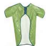
Medium Tulip apron H862

For a child 114–132 cm tall, approximately 5–7 years