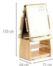
High art island, 71 cm wide H515 For ages 5–8 Includes 2 white/chalkboards and 6 magnets