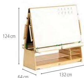
Low art island, 132 cm wide H520 For ages 2–5 Includes 2 white/chalkboards and 10 magnets