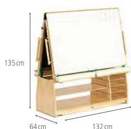
High art island, 132 cm wide H530 For ages 5–8 Includes 2 white/chalkboards and 10 magnets