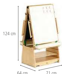
Low art island, 71 cm wide H500 For ages 2–5 Includes 2 white/chalkboards and 6 magnets