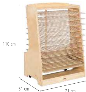
Drying rack H560

Place the Peg tree anywhere in the art area, allowing children to hang up their own aprons. Our Tulip aprons slide on easily and fasten at the back with Velcro. They're quick to clean: simply wipe off paint and glue with a wet cloth.