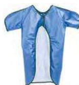
Large Tulip apron H863

Racks are strong steel wire with a UV-resistant coating. Fits A2 paper.