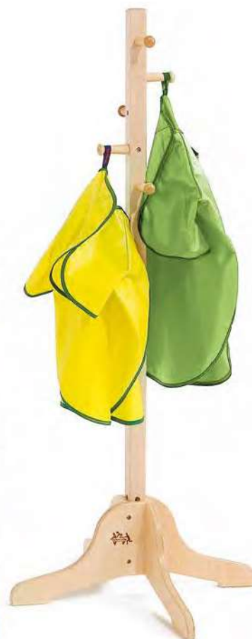
Peg tree (H559)

Removable tray catches paint drips and is easy to clean.