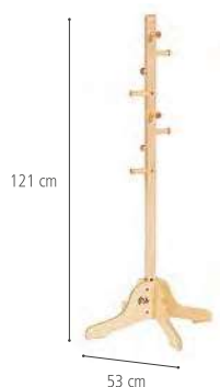
Peg tree H559