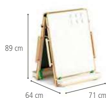
Floor easel, 71 cm wide H505 For ages 1–3 Includes 2 white/chalkboards and 6 magnets