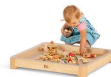
Floor tray: 10 cm high. For ages 9–15 months.