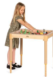
With high adjustable legs: Height adjusts from 56 to 79 cm. For ages 3 years and over.