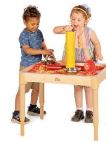
With medium adjustable legs: Height adjusts from 43 to 63 cm. For ages 15 months–5 years.