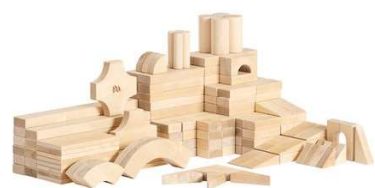
Quarter school set G461 180 blocks in 20 shapes