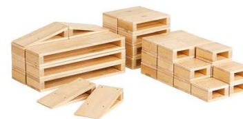
Nursery set B410 38 pieces in 4 shapes. Fits in two A60 Block trolleys.