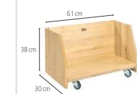
Block trolley A60