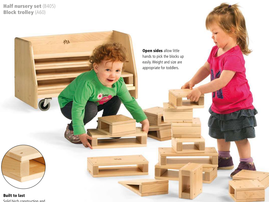
Half nursery set (B405) Block trolley (A60)

Open sides allow little hands to pick the blocks up easily. Weight and size are appropriate for toddlers.