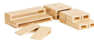
Half nursery set B405 19 pieces in 4 shapes. Fits in one A60 Block trolley.