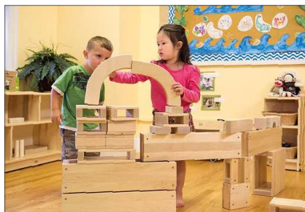
Mini hollow blocks are modular with Unit blocks and Hollow blocks, so all sizes can be used together.