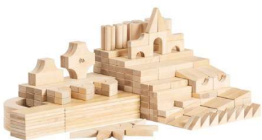
Half school set G462 360 blocks in 20 shapes