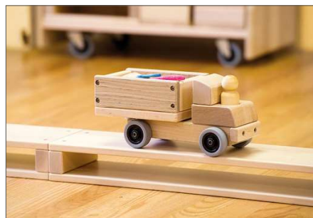
A vehicle for every road: Small trucks are the perfect size for this highway. See page 153.

Built to last Solid birch construction and clear, durable finish ensure decades of heavy-duty play.