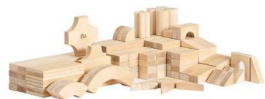
Preschool set G431 149 blocks in 20 shapes.