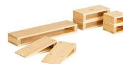
Introductory set B402 7 pieces in 4 shapes.

Video: The value of block play communityplaythings.co.uk/foundations