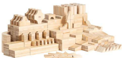
School set G464 720 blocks in 20 shapes Our largest set for 18–20 children

ECERS 22: 7.1, 7.2, 5.2; 4: 7.2 ITERS 19: 7.1; 15: 5.2