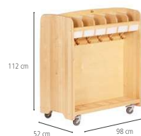
Coat storage trolley A300 For 12 children One coat peg per child