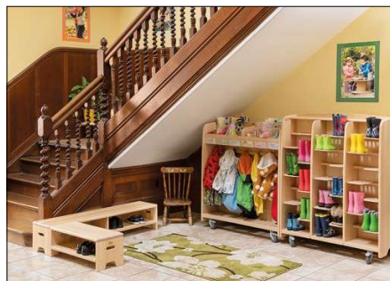
The Coat storage trolley fits into any available space – roll it out when you need it!