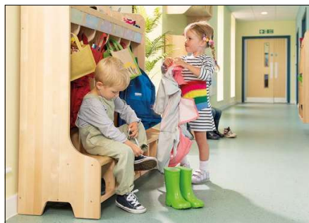
Children can put away shoes and coats independently in this easy-to-access Coat storage unit.

Water or dirt falls through plastic grates in cubbies. Slide a broom or mop underneath to clear it away.