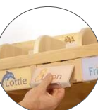
Labels are easy for teachers to change out, and there's even space for a photo.