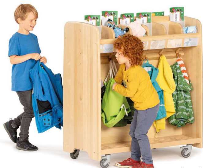
Coat storage trolley (A300)

Water or dirt falls through plastic grates in cubbies. Slide a broom or mop underneath to clear it away.