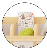
Clear pockets hold parent-teacher communication or artwork in a safe space.