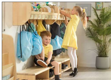
Promote independence with child-accessible cubbies and hooks. Personalise lockers with a name and photo.