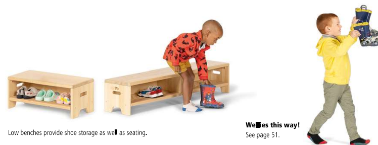
Low benches provide shoe storage as well as seating.