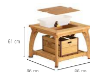
Outlast single water table set 61 cm W425 Includes table, shelf, pan, lid, Flow pan and deep crate For ages 4–6

Weatherproof wood? See p.7 to find out more.