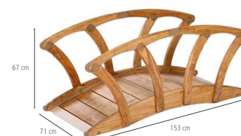
Outlast bridge W483