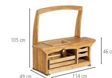
Outlast kitchenette sink 46 cm W452 Includes Shallow crate and 2 Nature trays