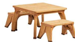
High square play table set W345 Includes a 50 cm table and two 30 cm seats. For ages 4–7