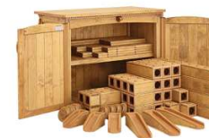
School complete set with storage W390 Includes Outlast storage unit with 40 blocks, 42 planks, 8 steering wheels and 6 ramps