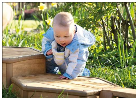
Outlast toddler platform 10 cm (W471)

Create age-appropriate climbing structures for your youngest explorers.