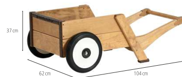
Outlast wheelbarrow W322