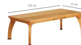
Rectangular Outlast play table W352 Seats up to 8. Specify 40, 46, 50 or 56 cm table height.