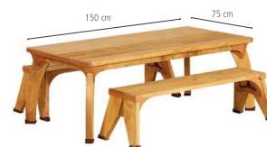
School rectangular play table set W356 Includes a 56 cm table and two 35 cm benches For ages 6–11

Smooth table surface enables you to take traditionally indoor activities like painting or mark-making outside.