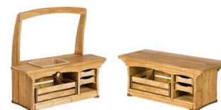
Outlast kitchenette 46 cm W450 Includes 2 Shallow crates and 4 Nature trays