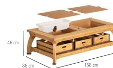
Outlast double water table set 46 cm W430

Includes table, shelf, 2 pans, 2 lids, Flow pan and 3 Deep crates For ages 4–6