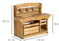
Outlast classic sink 56 cm W457 Includes deep crate, 2 Nature trays and 3 scoops