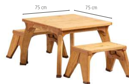
School square play table set W346 Includes a 56 cm table and two 35 cm seats. For ages 6–11

Rugged and versatile, Play tables and seats provide the perfect surface for open-ended outdoor activities from art projects to sand play. Solidly constructed with acetylated wood, Outlast equipment won't rot or warp, ensuring years of outdoor play and learning in any climate.