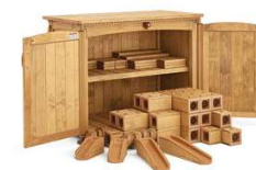
Nursery classic set with storage W389 Includes Outlast storage unit with 27 blocks, 27 planks, 6 steering wheels and 4 ramps