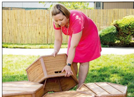
The modular, hexagonal platforms can be reconfigured easily by a teacher.