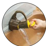
Outlast double water table set 61 cm (W435)

The child-friendly plug in the clear Flow pan allows children to freely experiment with water flow.