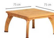
Square Outlast play table W342 Specify 40, 46, 50 or 56 cm table height.