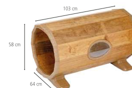
Outlast tunnel W482 Inside Tunnel diameter: 51 cm