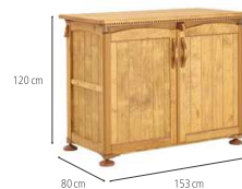
Outlast storage unit W303 For ages 3 and older