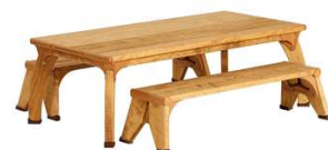
High rectangular play table set W355 Includes a 50 cm table and two 30 cm benches For ages 4–7