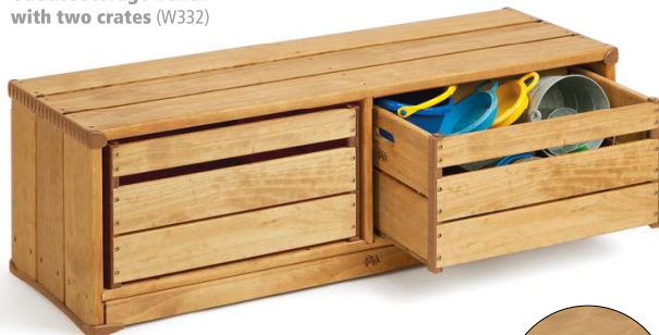
Outlast storage bench with two crates (W332)

Double duty Appropriate height for adult seating at point of play.