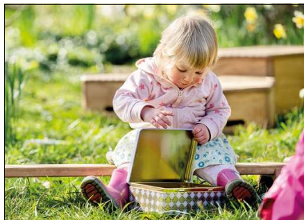
Balancing beams make a handy bench too!

All edges are heavily rounded for safety.