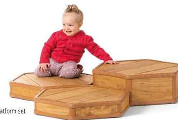
Starter platform set (W470)

Navigating the Tunnel is extra fun with a window to peek through; plus, a teacher can easily supervise the play and learning!