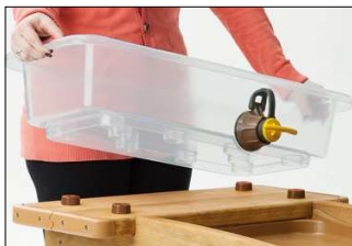
Outlast flow pan fits securely onto Outlast streambed or Water play tables.

Two sizes of durable crates keep everything organised. The slatted shelves allow sand and water to run through.