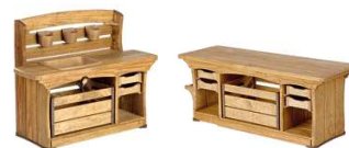
Outlast classic kitchen 56 cm W455 Includes 2 deep crates, 6 Nature trays and 3 scoops