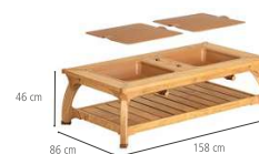
Outlast double water table 46 cm W432

Includes table, shelf, 2 pans and 2 lids For ages 4–6