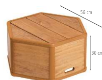
Outlast toddler platform 30 cm W473 For ages 12–36 months

The unique hexagon shape allows you to create circular, multi-level pathways.