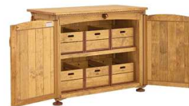
Outlast storage set W304 Includes Storage unit and 6 Crates For ages 3 and older

The Outlast storage bench provides teacher seating, and fits two crates that neatly hold outdoor toys. Weatherproof wood and durable design provide year-round outdoor use in your garden or covered play area.