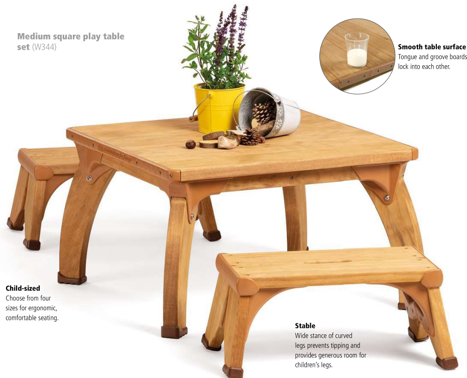
Medium square play table set (W344)

Child-sized Choose from four sizes for ergonomic, comfortable seating.