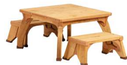
Medium square play table set W344 Includes a 46 cm table and two 25 cm seats. For ages 3–6