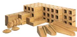
Nursery classic set W386 64 pieces