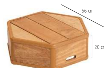
Outlast toddler platform 20 cm W472 For ages 9–36 months