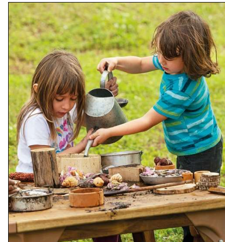
Bring on the messy, creative play! Outlast can withstand it all.