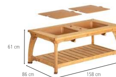
Outlast double water table 61 cm W433

Includes table, shelf, 2 pans, 2 lids, Flow pan and 3 Shallow crates For ages 2–4