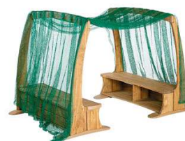
Outlast arbour W460 Includes Canopy and 2 Arbour benches

Designed to be easily moved or rearranged, the Arbour can be used anywhere in your outdoor area. And, like all Outlast products, the weatherproof wood will withstand years of play in any climate.