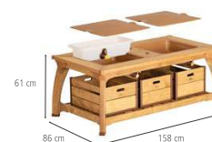
Outlast double water table set 61 cm W435

Weatherproof wood? See p. 7 to find out more.