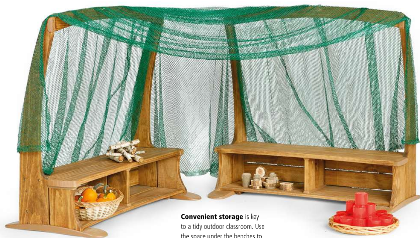
Outlast arbour (W460)

Convenient storage is key to a tidy outdoor classroom. Use the space under the benches to store natural materials or toys.