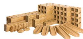
School complete set W388 96 pieces

For ages 3 and older Only school sets include longest blocks and planks