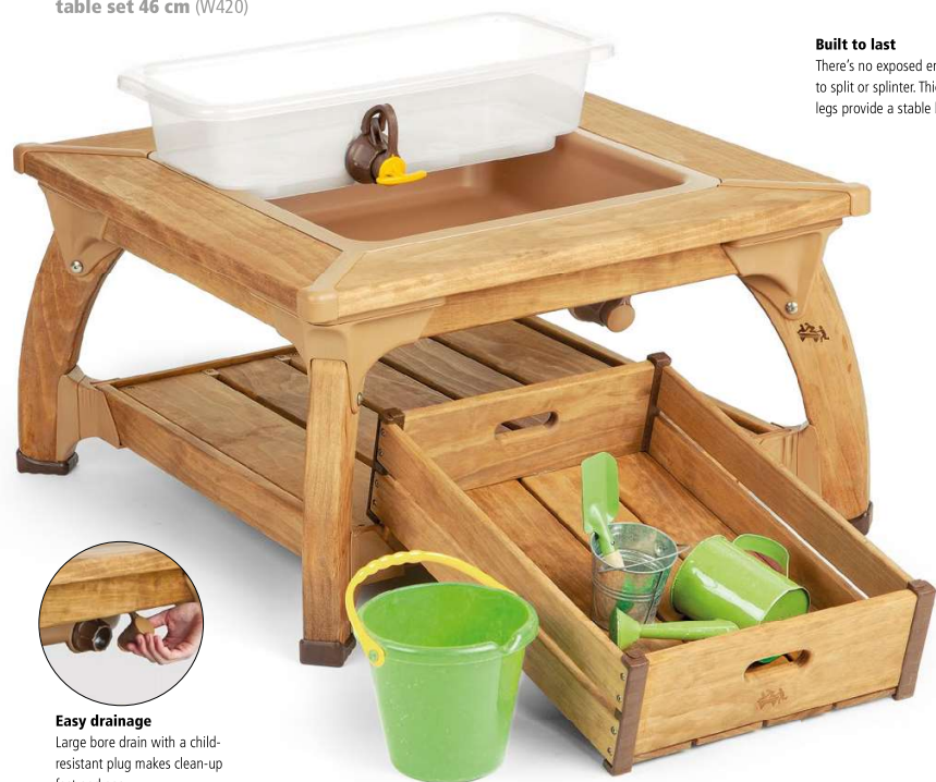
Outlast single water table set 46 cm (W420)

Built to last There's no exposed end grain to split or splinter. Thick, curved legs provide a stable base.