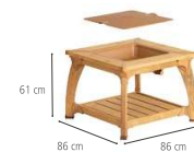
Outlast single water table 61 cm W423 Includes table, shelf, pan and lid For ages 4–6