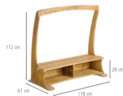
Outlast arbour bench W461