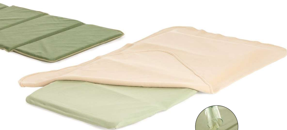
Rest mat (M62) with Rest mat sheet (G19) and Blanket (S16)

Fitted sheet is cotton knit with elastic all around; it stays snugly in place.