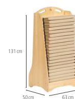
Rest mat stacker with 10 Rest mats M670 Includes 10 Rest mats