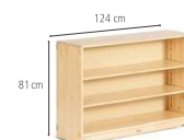
Adjustable shelf 124 x 81 cm F42 Holds 12 Rest mats Comes with 2 adjustable shelves