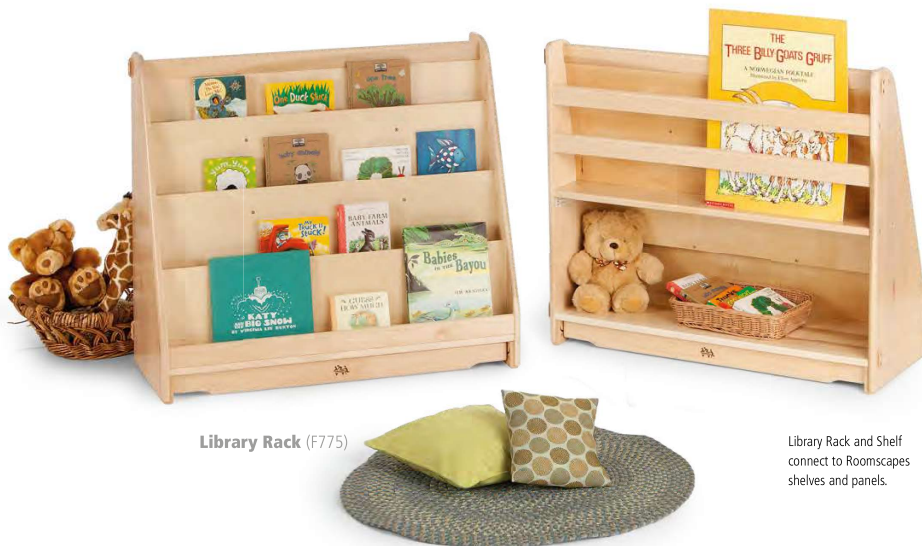
Library Rack (F775)

Up to roll. Down to stay. Just flip up the wheels, roll it where you want, then flip them down for a perfectly stationary unit.