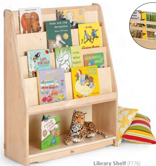
Library Shelf (F776)