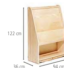
Library Shelf F776 Always connect to Roomscapes or place against a wall.

By connecting a few Roomscapes panels to the Library Rack and Shelf, you can create a cosy library corner set apart from the main activity area, offering a calm space to browse and enjoy books.