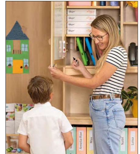
Foster an organised environment. Display Cupboards offer an iPad storage rack and adjustable shelves, with optional storage space below.