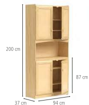
Display Cupboard 94 cm, N913 Extra Shelf F603 available for Cupboard top and base.

Arrives in two fully assembled units. Stack the units and tighten the pre-installed screws using the tool provided. The Cupboard must be placed against a wall and securely fixed to that wall.