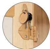
Storage Cupboard (N917)

Key hook included Don't lose those keys if the doors are staying open!