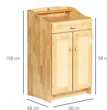
Teacher Standing Desk H870 Includes 2 Half Totes, 4 Quarter Totes, 2 adjustable shelves, 2 keys

This compact and convenient workspace comes with lockable storage and adjustable shelves. With everything convenient and tidy, you can get paperwork done quickly and spend more time with the children. There's plenty of room for storage and record keeping, while the writing surface is water-resistant and easy to clean. Cable ports are well-located for charging devices.