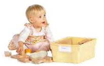
More options on the next page!