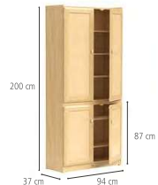
Storage Cupboard 94 cm N917 Extra Shelf F603 available for Cupboard top and base.