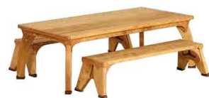
High Rectangular Play Table Set W355 Includes a 50 cm Table and two 30 cm Benches For ages 4–7