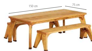
School Rectangular Play Table Set W356 Includes a 56 cm Table and two 35 cm Benches For ages 6–8

The smooth water-resistant surface invites picnics, group activities or independent projects. The unattached benches provide flexible seating arrangements and inspire active play such as balancing and transporting.