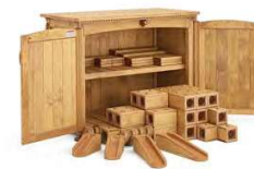
Nursery Classic Set with Storage W389 Includes Outlast Storage Unit with 27 Blocks, 27 Planks, 6 Steering Wheels and 4 Ramps