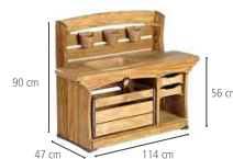
Outlast Classic Sink 56 cm W457 Includes Deep Crate, 2 Nature Trays and 3 Scoops