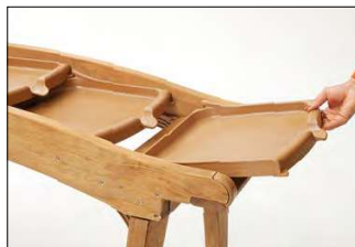
Streambed trays remove easily for clean-up.