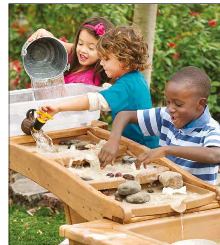
The water is recycled the old-fashioned way: by hand! Bucket brigades build cooperation, team work and communication skills.