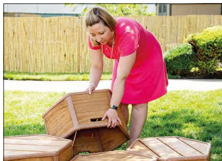
The modular, hexagonal Platforms can be reconfigured easily by a teacher.