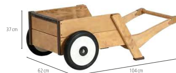
Outlast Wheelbarrow W322