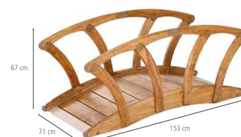
Outlast Bridge W483