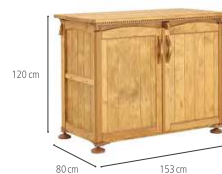
Outlast Storage Unit W303 For ages 3 and older