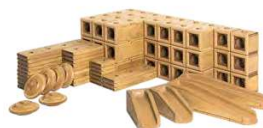
Nursery Classic Set W386 64 pieces