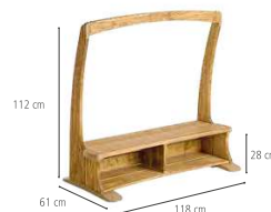
Outlast Arbour Bench W461