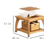
Single Water Table Set 61 cm W425

Includes Table, Shelf, 2 Pans, 2 Lids, Flow Pan and 3 Deep Crates For ages 4–6