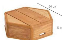
Outlast Toddler Platform 20 cm W472 For ages 9–36 months