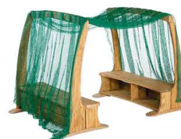
Outlast Arbour W460 Includes Canopy and 2 Arbour Benches

Designed to be easily moved or rearranged, the Arbour can be used anywhere in your outdoor area. And, like all Outlast products, the weatherproof wood will withstand years of play in any climate.