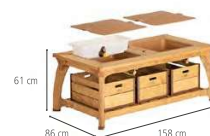
Double Water Table Set 61 cm W435

Weatherproof wood? See p. 7 to find out more.