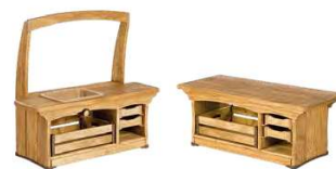
Outlast Kitchenette 46 cm W450 Includes 2 Shallow Crates and 4 Nature Trays