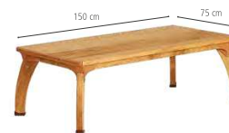
Rectangular Outlast Play Table W352 Seats up to 8. Specify 40, 46, 50 or 56 cm Table height.

These tables have sturdy solid wood surfaces, enabling you to have mealtimes or take activities outside.