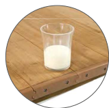
Smooth table surface Tongue and groove boards lock into each other.

Choose the appropriate table and bench height for ergonomic, comfortable seating.