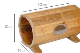
Outlast Tunnel W482 Inside Tunnel diameter: 51 cm