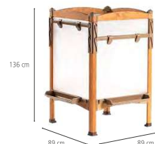
Outlast Easel Island W503 Includes 4 Supply Trays