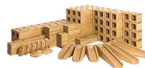
School Complete Set W388 96 pieces

For ages 3 and older Only School Sets include longest blocks and planks