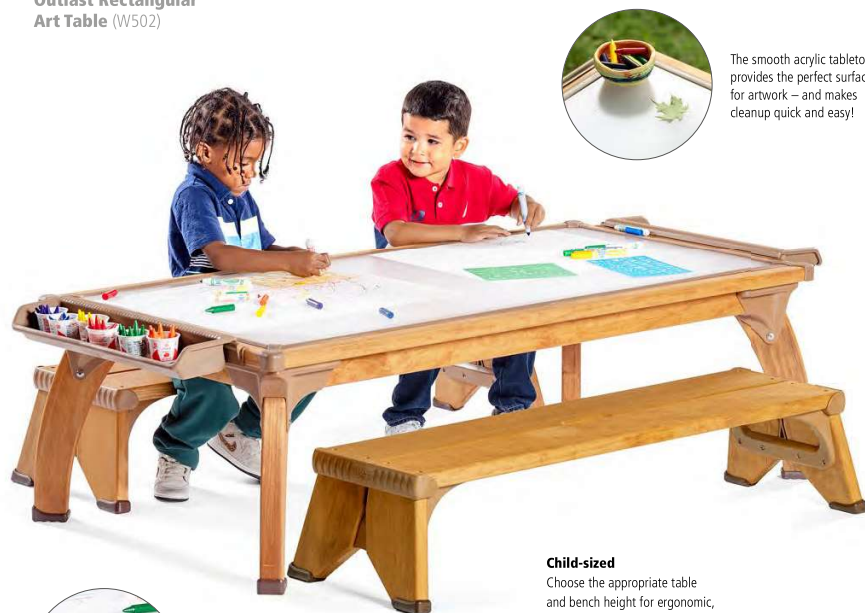
Outlast Rectangular Art Table (W502)