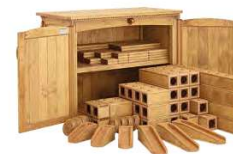
School Complete Set with Storage W390 Includes Outlast Storage Unit with 40 Blocks, 42 Planks, 8 Steering Wheels and 6 Ramps