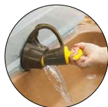
Outlast Double Water Table Set 61 cm (W435)

The child-friendly plug in the clear Flow Pan allows children to freely experiment with water flow.